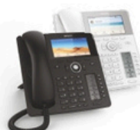
D785 / 785N