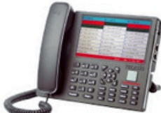
DTS700 DIGITAL PHONE ITS700 IP PHONE