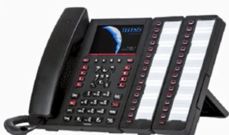
DTSX DIGITAL PHONE ITSX IP PHONE

All-in-one smart business communication server