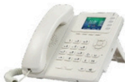
SIP-T790 IP PHONE