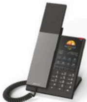
HD350W WiFi Hotel IP Phone