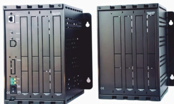
Built-in 112 SIP Port Licences