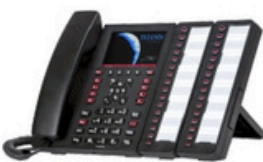
DTSX DIGITAL PHONE ITSX IP PHONE